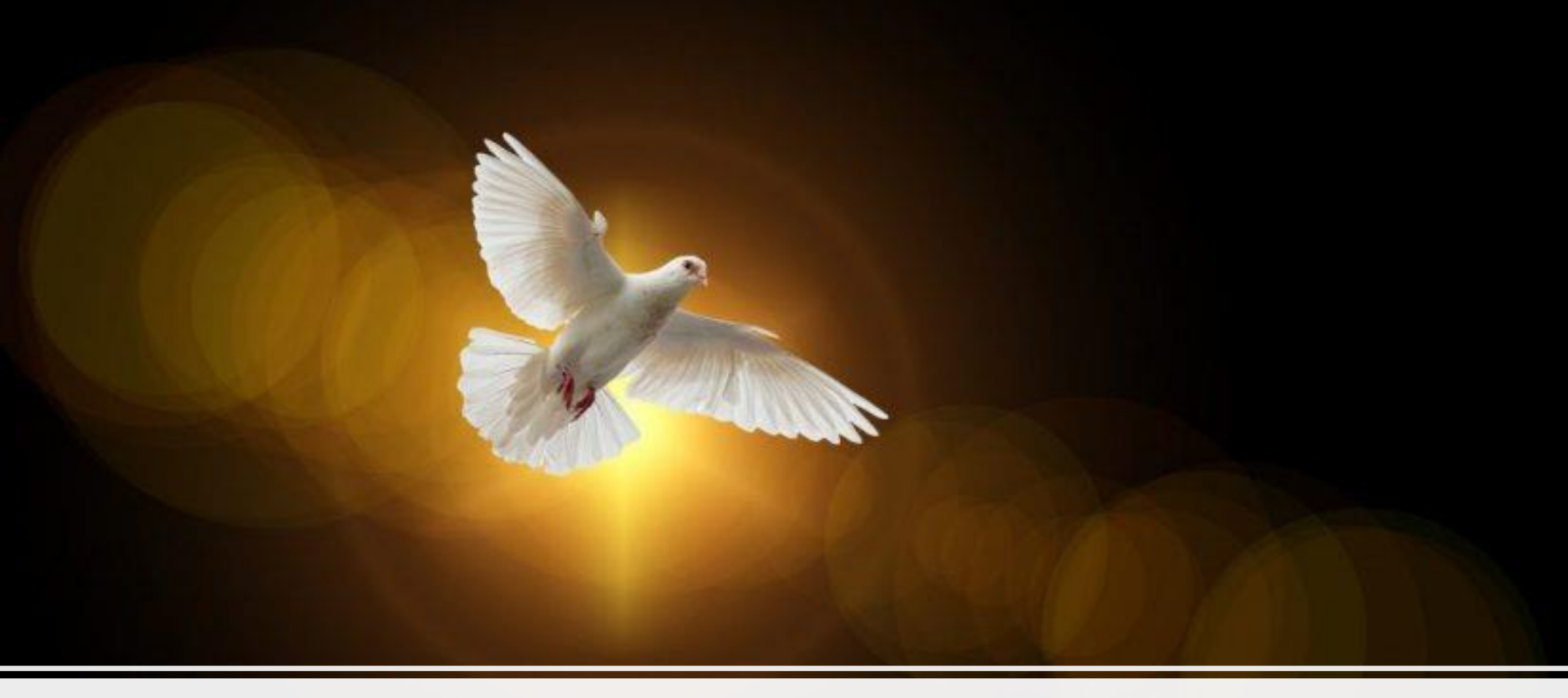
End Week 1